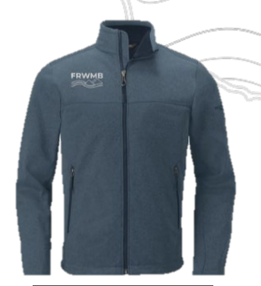
Quantity 15 Price: $1,561.02