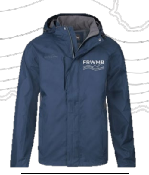
Quantity 15 Price: $1,737.73