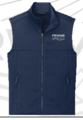
Quantity 15 Price: $681.85