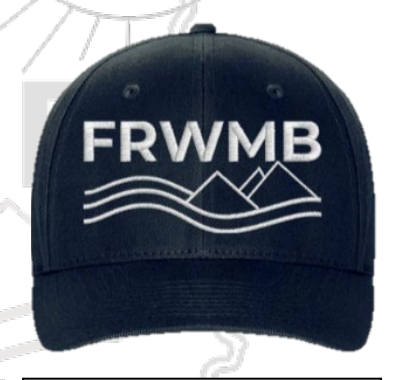
Quantity 15 Price: $287.07